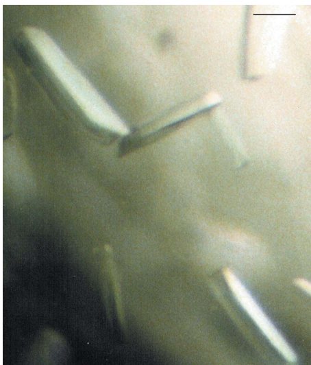
Figure 1 Crystals of D. desulfuricans ATPS (the scale bar is 0.1 mm in length).

D. desulfuricans ATCC 27774 cells were grown under anaerobic conditions in the medium described by Liu & Peck (1981) using nitrate as a terminal electron acceptor. Cells were harvested at the beginning of the stationary phase and were resuspended in 10 mM Tris-HCl buffer pH 7.6 containing 1 mM PMSF at a ratio of 1:1 (w:v). The cells were lysed using a French press (62 MPa). The extract was centrifuged at 15 000g for 65 min and then at 180 000g for 75 min in order to eliminate the membrane fraction. The purification procedure was adapted from that published previously (Gavel et al. , 1998) and included four chromatographic steps: ion exchange on DEAE-52 cellulose and Source 15Q (Pharmacia), molecular-weight exclusion on Superdex 200 (Pharmacia) and adsorption chromatography on hydroxyapatite (BioRad). All purification procedures were performed aerobically at 277 K. Specific activities were determined at each step in the purification process (Gavel et al. , 1998). The purity of the final preparation of ATPS and subunit identification were